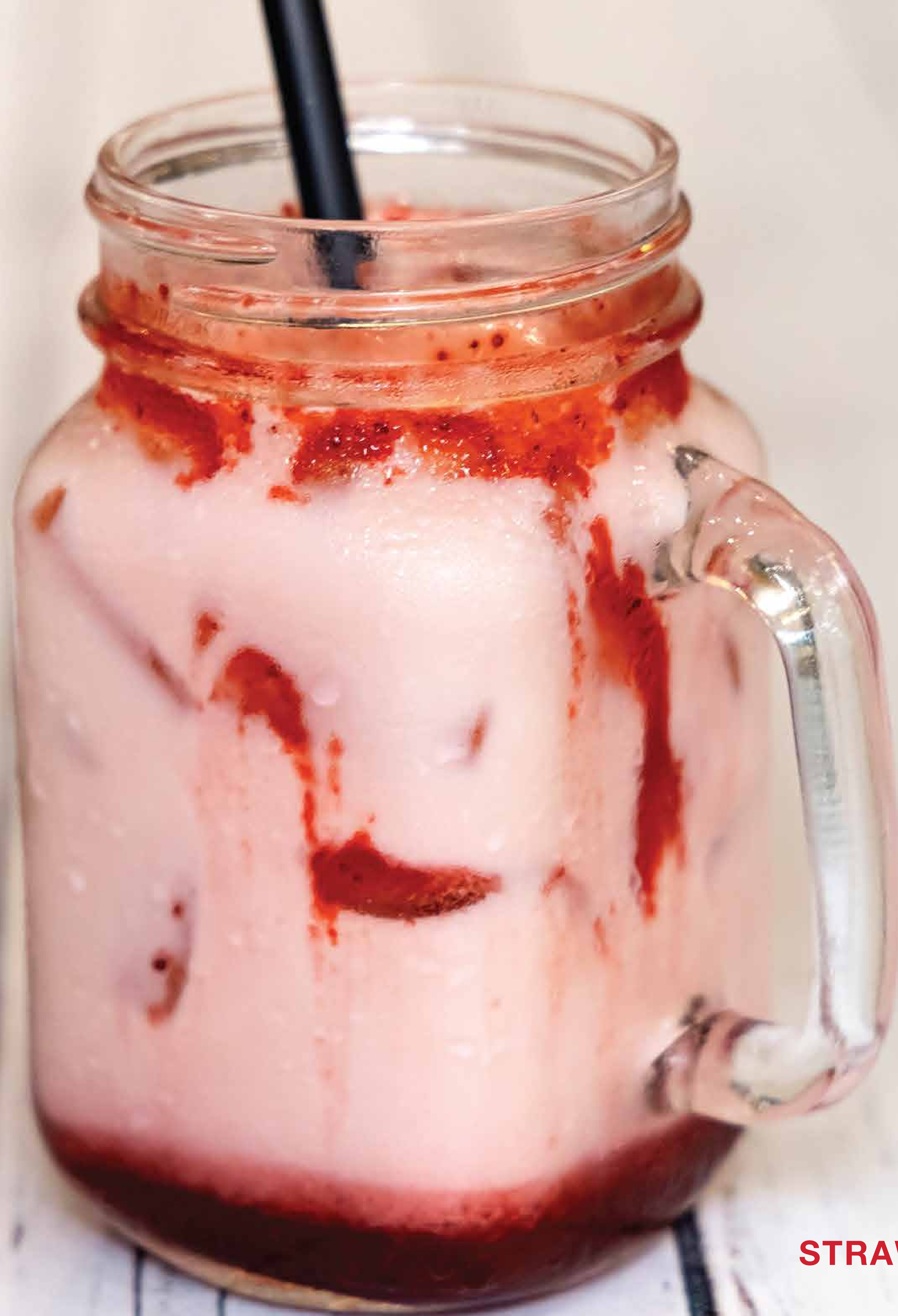
STRAWBERRY OAT MILK LATTE